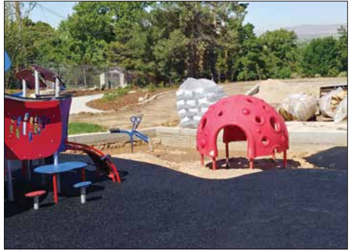
Kiddos will have a great time exploring the new features of the Island View Park playground.

The park will feature several one-of-a-kind playground structures and multi-sport courts for all ages. The Parks and Recreation committee hopes to be able to hold a grand opening for the park in the fall, so keep an eye on city's social media pages and newsletters for future announcements. We are eager to see the fun and adventures that will take place in this amazing new part of our community!!