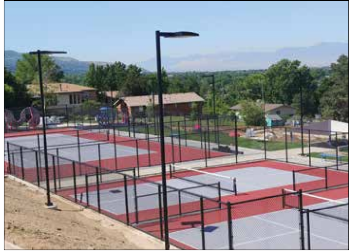
All new multi-sport courts will be fun for all ages at the remodeled Island View Park.

Each year Centerville City is required to publish a Drinking Water Quality Report and make it available to all customers. It shows the test results for microbiological, inorganic and radioactive contaminants. Centerville's drinking water complies with all applicable standards. Testing for contaminants occurs on a regular basis - either daily, weekly, monthly, annually or every three years - depending on the substance. Our constant goal is to provide you with a safe and dependable supply of drinking water. We want you to understand the efforts we make to continually improve the water process and protect our water resources. We are committed to ensuring the quality of your water. The 2019 Annual Water Quality Report can be found at centervilleut.net/departments/public-works/