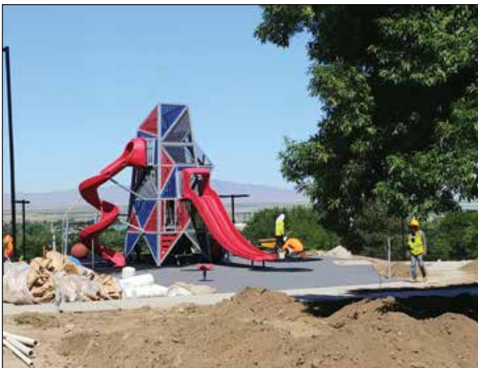
The renovated Island View Park will feature unique playground structures.