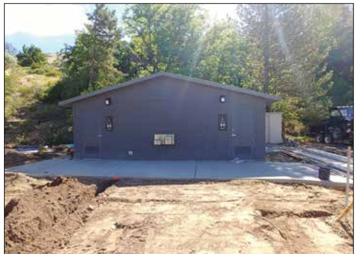
Modern, new restrooms will provide conveniences for the patrons of the park.